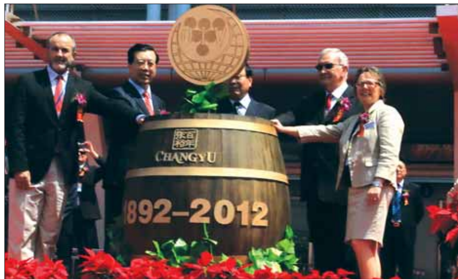
Government officials and international guests attend the opening ceremony.

"Although the wine market in China is fast growing, it still needs time for Chinese to understand wine culture. I hope they can learn to enjoy diverse wines with different food and drink some wine everyday," he said.