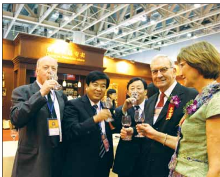
International aficionados taste Changyu wine at the on-going exposition.