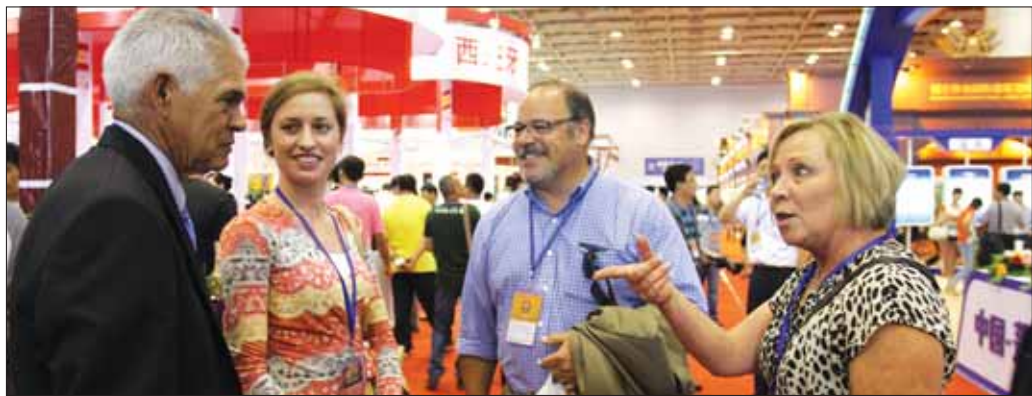
Australian visitors are among the 10,000 participants expected for the event.

The city government also plans to build a wine-themed square and shopping streets to further boost tourism.